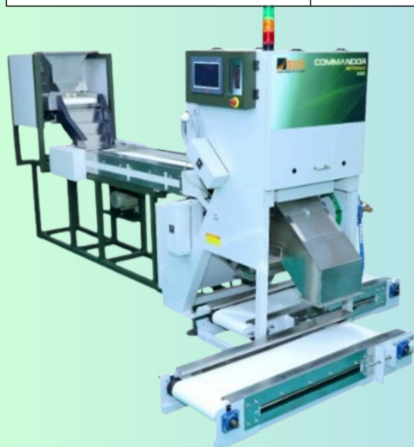
BELT TYPE 300MM